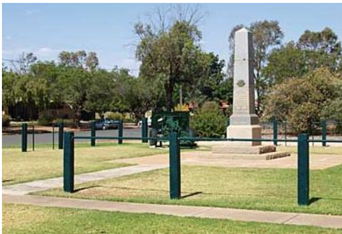
Lockhart and District War Memorial