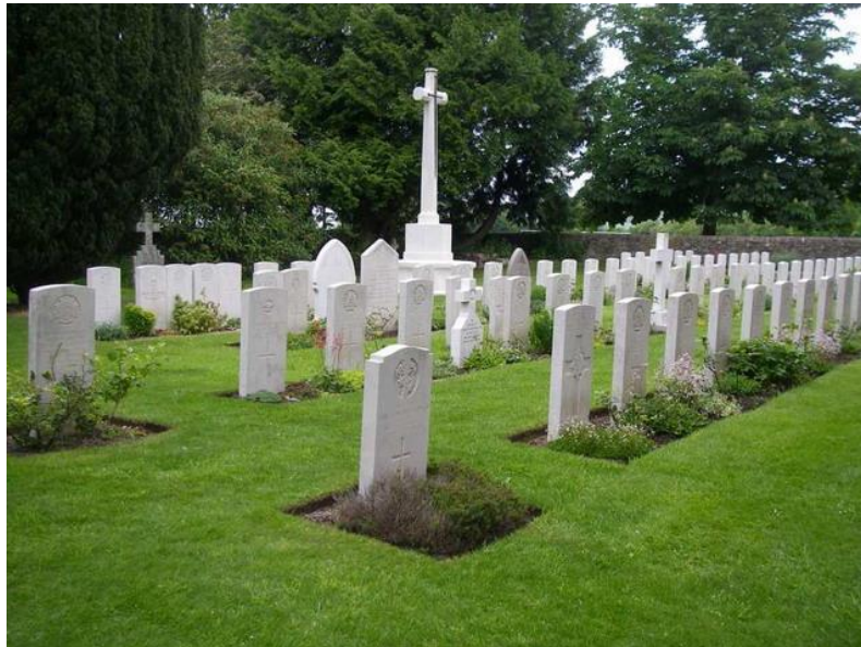
War Graves at Sutton Veny